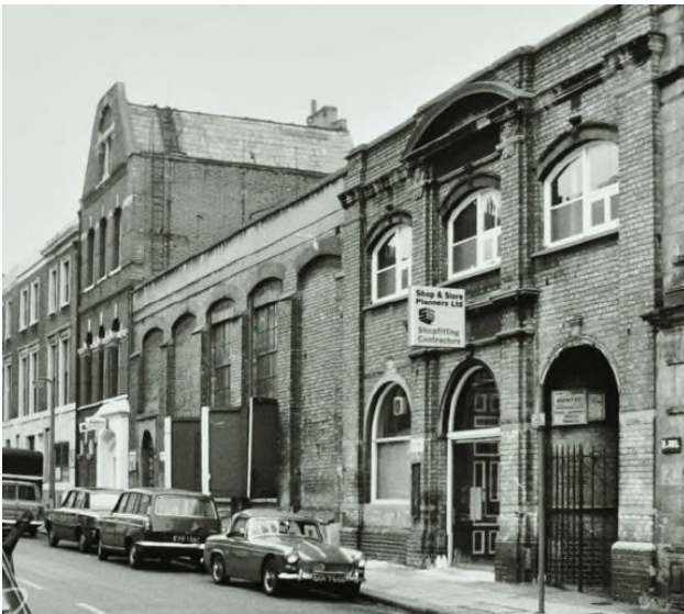
Shop & Store Planners

ground floor with 9 flats on the first and second floors (the latter being within the roof). The restaurant premises include the former under stage pit area, which remains as a lower level adjunct to the bar, with the kitchens at the back in the former Wellington Hall part of the building, which has rear emergency access into Terrett's Place.