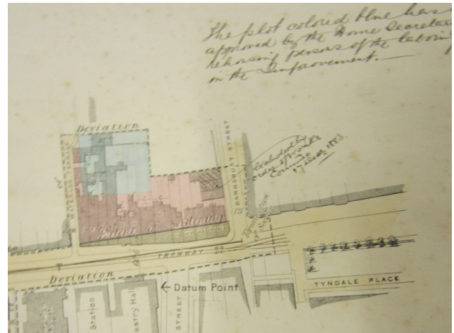
Site of Premier House as approved for rehousing persons of the labouring class displaced by the widening of Upper Street in 1888

design, probably influenced by the work of Norman Shaw. The original Victorian setts paving the street remain in this section of Waterloo Terrace.