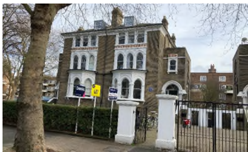
120 Highbury New Park