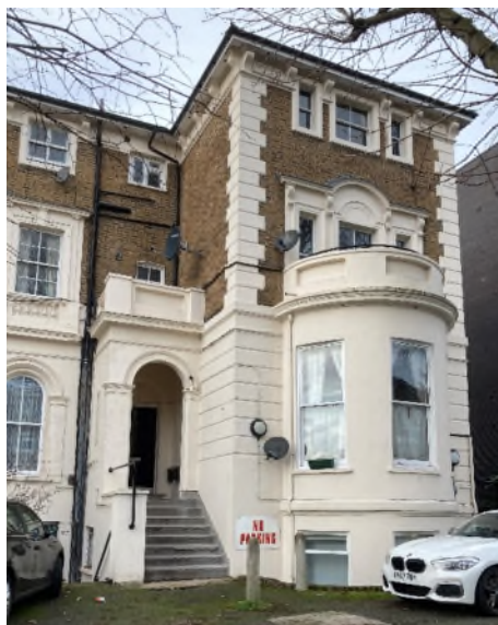
169-171, Green Lanes

Newington Green was a good deal posher than it is now