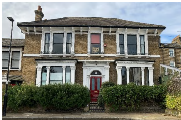
85, Balfour Road: Louise Villa

Turn left down Kelross Road, right onto Aberdeen Road, left onto Highbury Grange and left again onto Balfour Road, developed in 1873-5. Tucked away on the left, as Balfour Road turns at a right angle, is Louise Villa. Its builder has embellished every feature, with prominent brackets under overhanging eaves, tripartite windows on both floors and cast-iron decorative railings on the first-floor sills. The ground