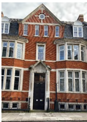
Highbury Vale Police station